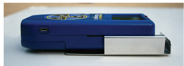
Optional Wipe Test Plate Shown