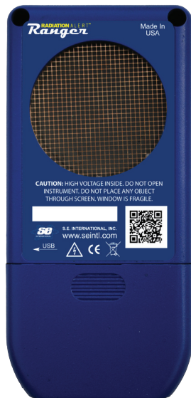
Detector Window and AA Battery Door on Back